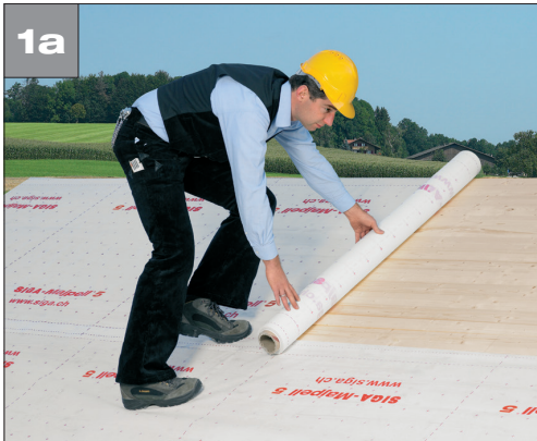
Above-rafter insulation with Majpell 5: • Lay Majpell 5 with the smooth side and the writing facing you