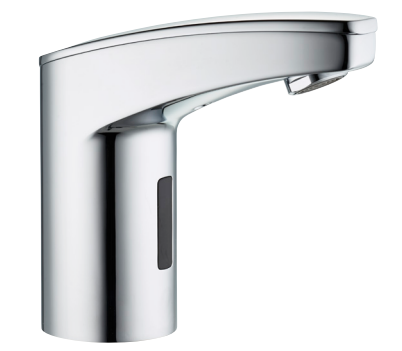
WSH Sensor Tap