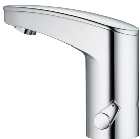
Temperature adjustment lever